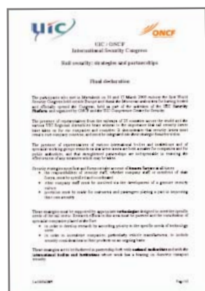
Final UIC-ONCF declaration adopted unanimously by participants.

The final declaration adopted unanimously by participants emphasises the need to continue work on security with both a global outlook taking account of risks and threats, and a focus on each UIC Region. The declaration highlights the need for international-level decisions regarding rail security to strengthen existing arrangements, and requests that the suitability of creating a competent international authority be examined.