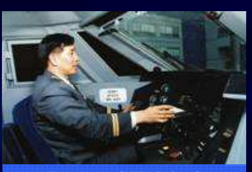
Transport (KTX Driver)