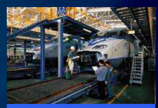
Rolling Stock Depot (KTX)